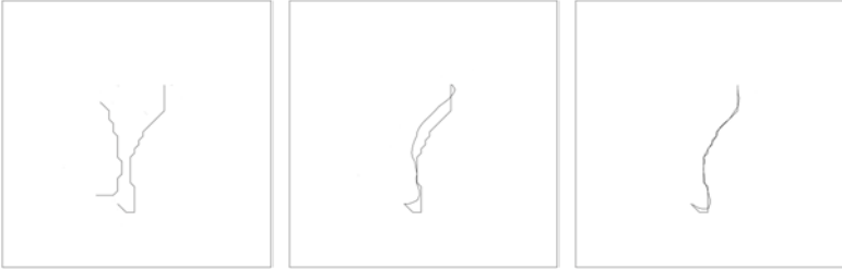
Fig. 1. Left panel: The two curves to be matched. Middle panel: The position of the curves after matching the end points. Right panel: The final result of matching the two curves.

Update \varphi_i \leftarrow \varphi_i^*(g_{t=1}^{new}(x))