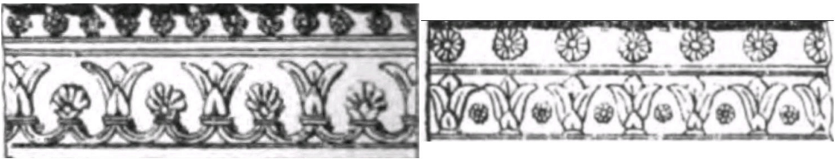
Figure 1: Friezes from Ancient Persepolis

First, a lesson in architecture. A frieze is a horizontal band of decoration around a building. These are some friezes from buildings in Ancient Persepolis. Note how they feature symmetrical, repeating patterns, and it is easy to see how you could keep drawing them to the left or the right, infinitely far. In mathematics, a frieze pattern will be a pattern drawn on an infinitely long band (if you want some kind of precision, imagine the set \mathbb{R} \times [0, 1] , which is the set of points (x, y) in the plane where 0 \leq y \leq 1 ), that has a certain kind of symmetry.