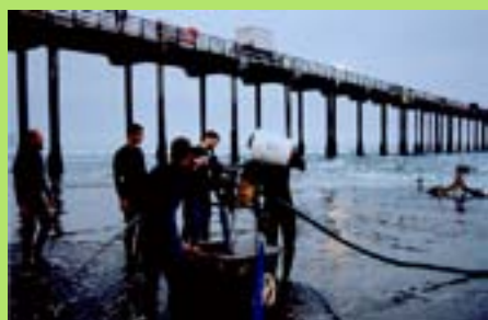
MPL ocean optics experiment underway on the beach beneath SIO's pier

Summer Intern salary will be $14.00 per hour, not to exceed 40 hours per week. This program lasts for approximately 10 consecutive weeks.