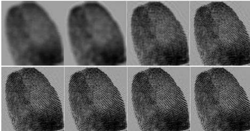
FIGURE 3. Top left to bottom right: blurred image, several iterates using (11): 1st, 100th, 500th, 1000th, 2000th, 3000th, 4000th.

note that the numerical results in Table 2 were obtained on a different computer and should thus not be compared with this Table.) Finally, we show in Figure 5 the result of a Cartoon+Texture decomposition of the same image (without blur) obtained by the surrogate-based iteration (15).