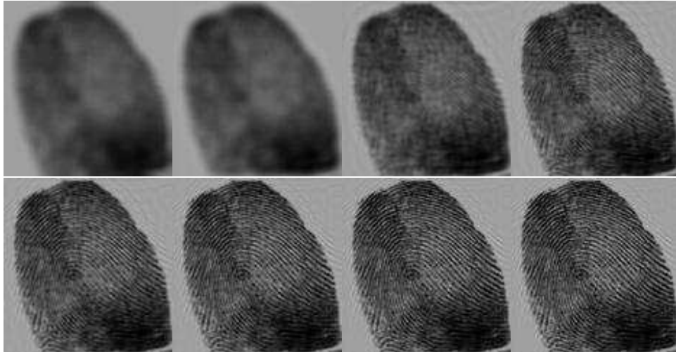
FIGURE 2. Top left to bottom right: blurred image, several iterates using the wavelets scheme: 1st, 100th, 500th, 1000th, 2000th, 3000th, 4000th.