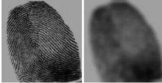
FIGURE 1. Top left: original image. Top right: blurred version.

we define the corresponding frame operator F ,