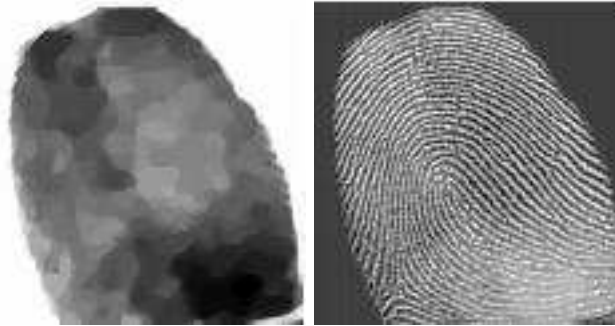
FIGURE 5. Decomposition into cartoon (left) and texture (right) of the fingerprint image without blur, obtained using the model (15).