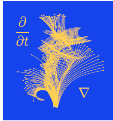
Design #4 (front)