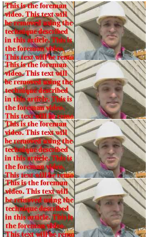
Figure 2. Four frames from the ‘Foreman’ video in which the lettering has been removed using Navier-Stokes inpainting (available electronically).

Figure 2 shows four frames of the ‘Foreman’ video in which lettering overlay has been removed using Navier-Stokes inpainting. The inpainting is done frame-by-frame using the same method outlined in the previous subsection. Notice that this approach, though straightforward, shows very good results: sharp, no color artifacts, no motion artifacts.